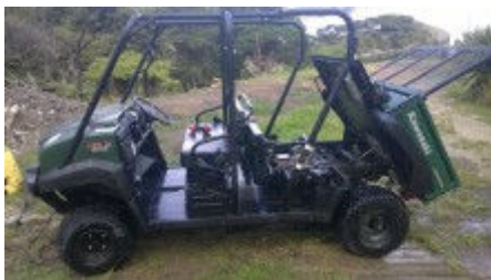
Hydraulic tipper also recently fitted