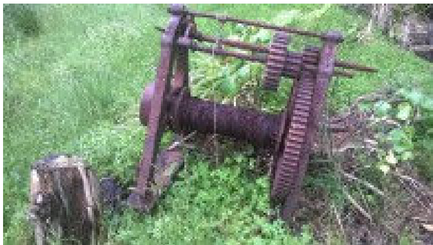
Piece of history / winch at Crawford's Bay