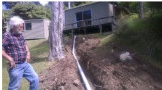
Laying grey water drainage from self contained cabin