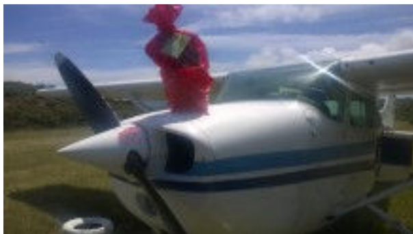
Christmas arriving at Motu Kaikoura 2014