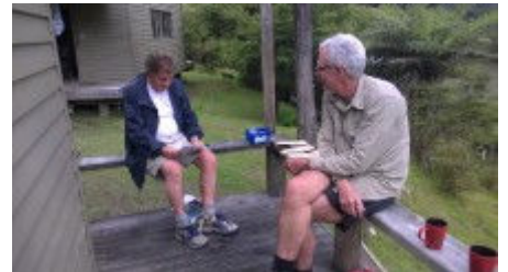
Reviewing their results